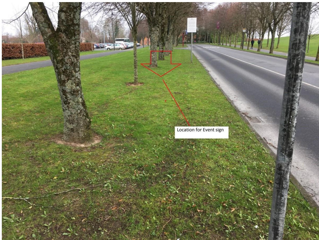
Figure 2: East gate entrance