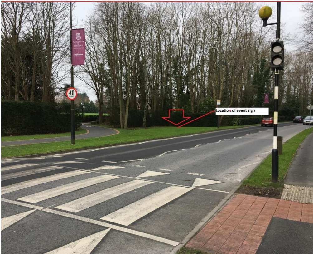
Figure 3: Flagpole entrance